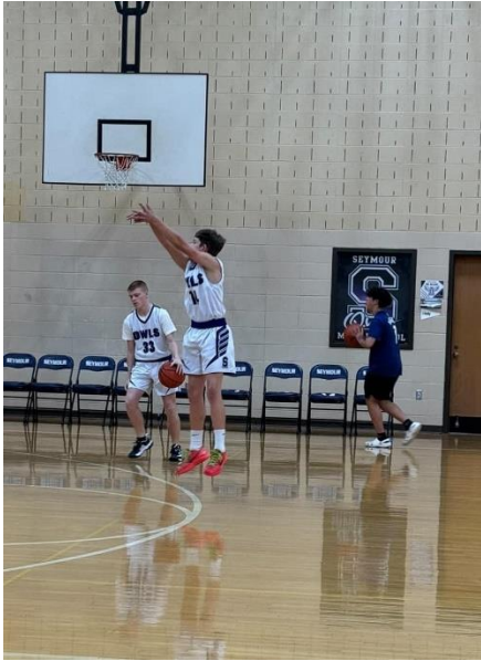
Brayton #14 Seymour Middle School